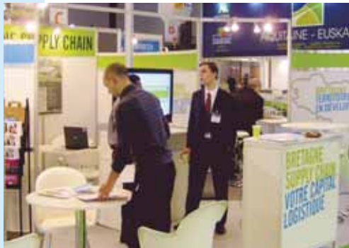
10 Breton companies were present on the Bretagne Supply Chain stand at the most recent SITL conference in Paris.

In Brittany, only a few small and medium-sized companies have structured their logistics chains and thereby know the benefits of an optimised organisation. However those who have become involved in this approach are doing better than others and are benefiting from a faster response time and a higher level of performance. With this in mind, logistics specialists – the Rennes CCI, ESLI, and Aslog joined by Ouest Logistics, RFID